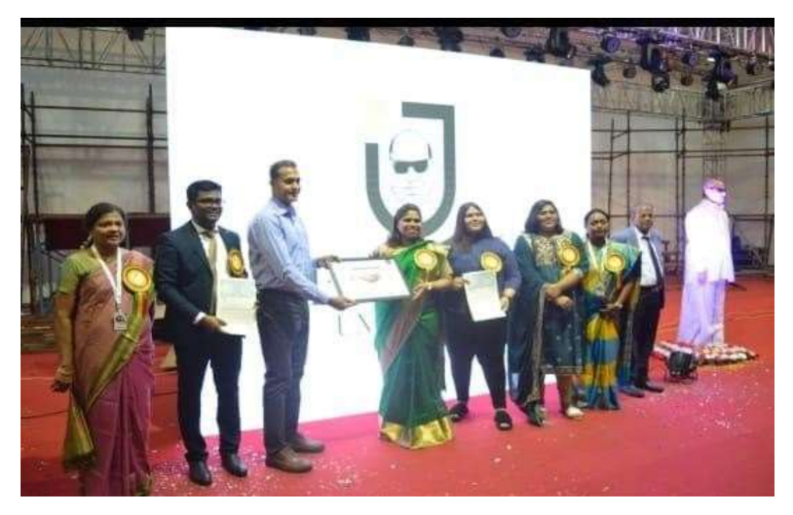
Image 1: Score Getter - Go Abroad and Jeppiaar University Signing a MOU

Objective: The Memorandum of Understanding (MOU) aims to establish a Collaborative Partnership between Jeppiaar University and Score Getter to provide valuable assistance to students in pursuing international education and accessing lucrative career Prospects.