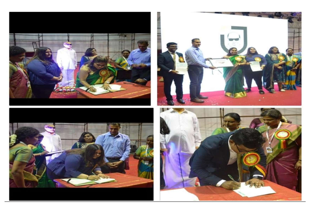
Image 2: Score Getter - Go Abroad and Jeppiaar University Signing a MOU

<u>Shared Vision: In signing this MOU. Score Getter – Go Aboard and Jeppiaar</u> <u>University Express their Shared Vision of Empowering Students with the Tools and</u> <u>Support Needed to Excel Academically. Secure Lucrative Placements and Realize their</u> <u>Future Goal</u>