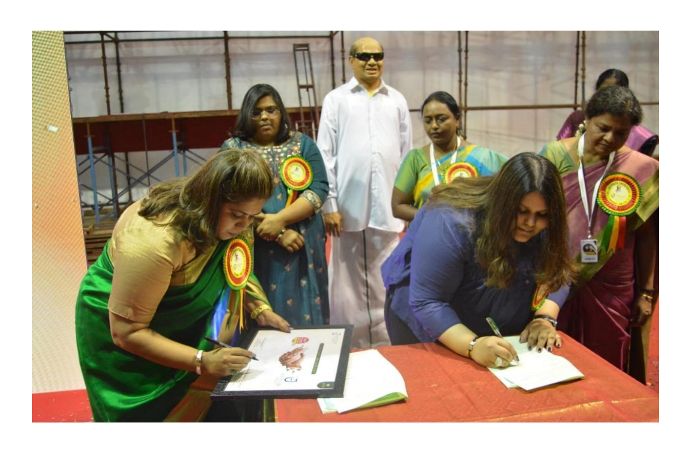
Signing of MoU