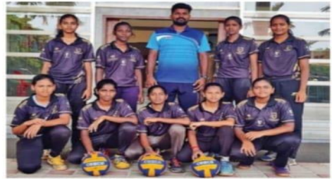
Jeppiaar MHSS, winners of the volleyball event in the Ekalavya sports fest at GRT Mahalakshmi Vidhyalaya Senior Secondary School, Tiruttani.

Jeppiaar University will conduct the JEPSPO '23, a state-level inter-school sports fest from July 21 to 23. No entry fees for the tournament. Last date of entry is July 15. For details, contact: 94446 11278.