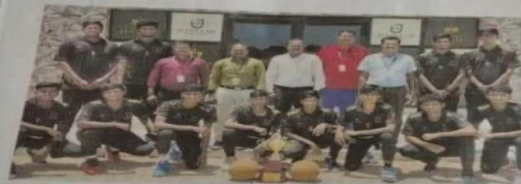
Shining bright: Jeppiaar eased past Annamalai University in the final.